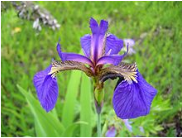
Figure 2: Photograph of setosa species.